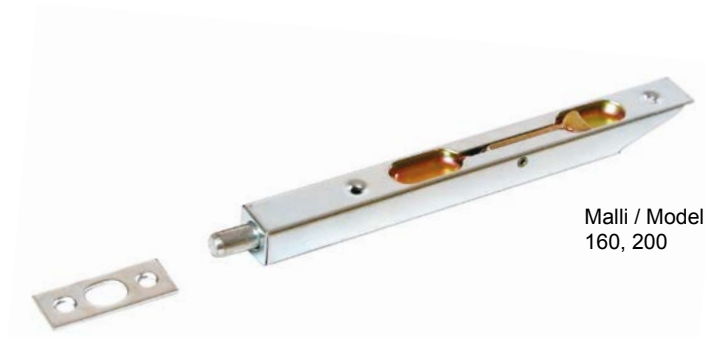
Malli / Model 160, 200